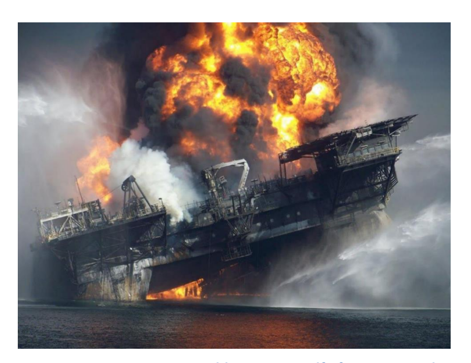
Figure A1— Deepwater Horizon blow out in Gulf of Mexico, April 20, 2010